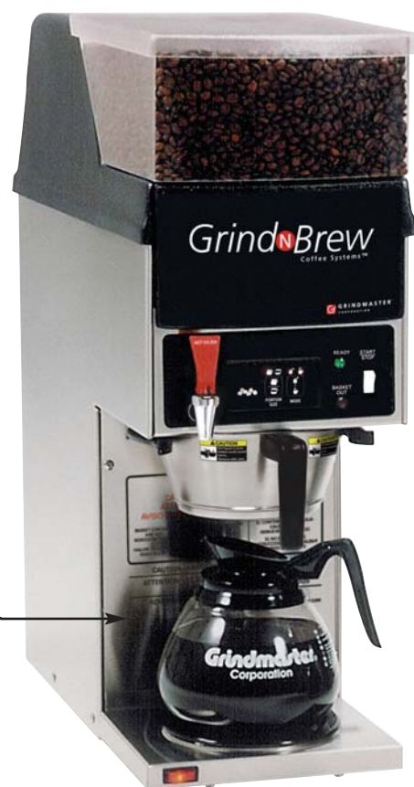
Model 11H (Decanter sold separately)

Digitally controlled Single Bean Grind'n Brew™ Brewer System. Brewer will maintain brew temperature to \pm 1^{\circ}\text{F} throughout brew cycle. Brew temperature, brew volume (full and half batch), grind portions (full and half batch), operator defined pre-infusion/pulse brewing, energy savings and Low Temp/No Brew are programmable from the front display.