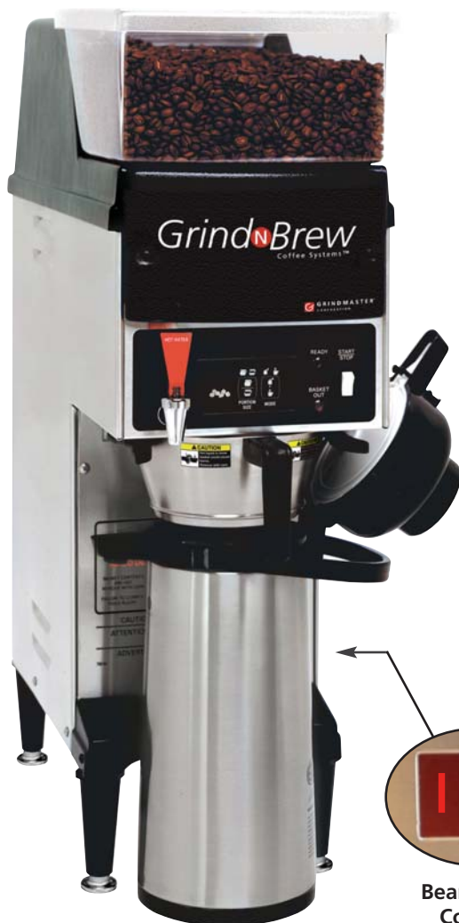
Model 10H (Airpot sold separately)